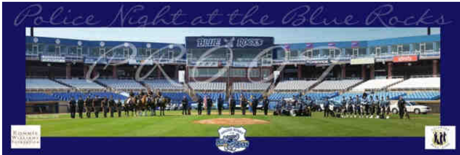
Photo 1 - Infield